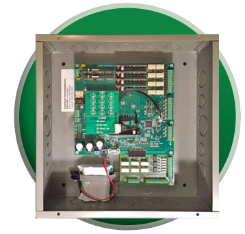
EMCS-MR - Machine Room