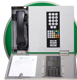
EMCS - Lobby (Open View)