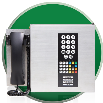
EMCS-OEM - Lobby Panel

Integrated PLM with easily programmable alarm groups and sophisticated diagnostics.