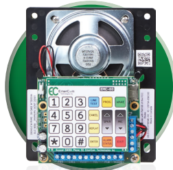
EMC-60 Panel Mount

The touch keypad has more feature keys and indicator LED's including a line-test feature. Voice responses available in multiple languages make the remote programming feature very user-friendly for setup and use, including the ability to simulate an emergency call from off-site. The phone can call an off-site number on a regular basis and report the status of the phone.