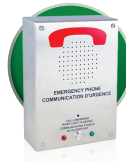
EMC-60-BX Box Style

The Phone Line Monitoring (PLM) feature monitors the phone line as required by ASME A17.1/CSA B44 Code. A pair of contacts is built-in, which will open on alarm (fail-safe) and a PLM test feature is built-in to briefly simulate an alarm. The phone can automatically call a programmed phone number to verify phone operation on a regular basis and has 7 status LEDs which provide the essential information at a glance.